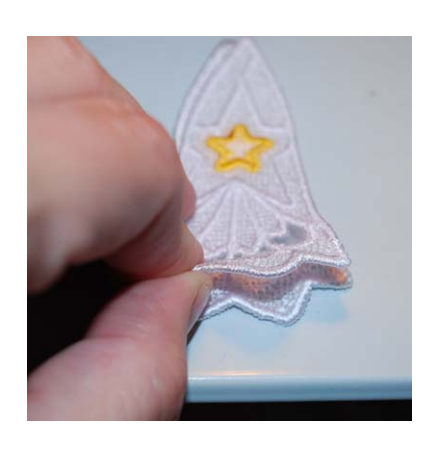
Step 1: Place one panel on top of the other right side to right side.

This stage of the project is to assemble the ornament.