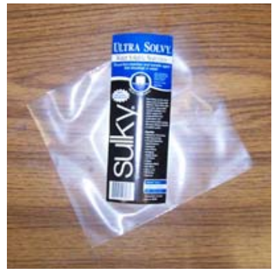
Step 1: Cut a piece of Solvy that is a little larger than your hoop.

The images show designs from the Lace Halloween Charms but the instructions apply for the leaves also.