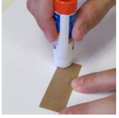
Step 2: Once you have the names all ready turn them over and apply glue.

Example paper sizes: Susanna is 2 1/4" wide x 7/8" high Nate is 2" wide x 7/8" high