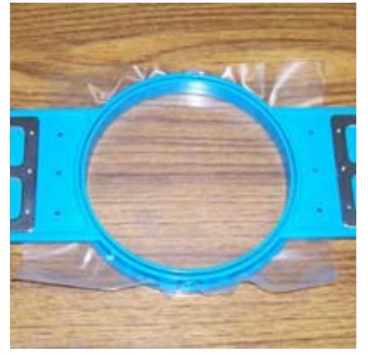
Step 2: Hoop Solvy, making sure that it is hooped very tightly.