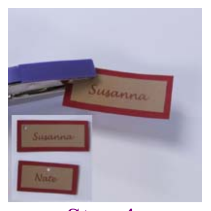
Step 4: Punch a hole either in the corner or top middle of the cards.

Example sizes of bottom cardstock: Susanna: 2 ¾" wide x 1 ¼" high Nate: 2 ¼" wide x 1 ¼" high