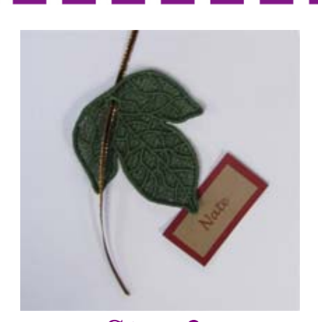
Step 3: Thread your piece of ribbon through the hole in the large leaf.