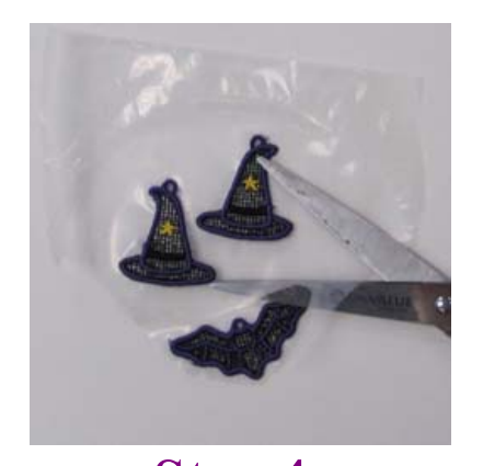
Step 4: Once the design is done embroidering. Remove from the machine and trim the excess solvy around the outside of the design.