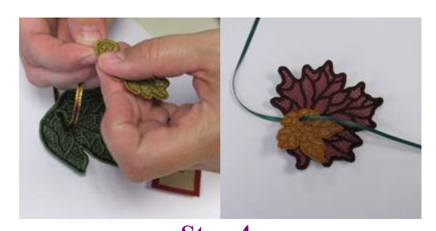
Step 4: Then thread the ribbon through the name card and small leaf.