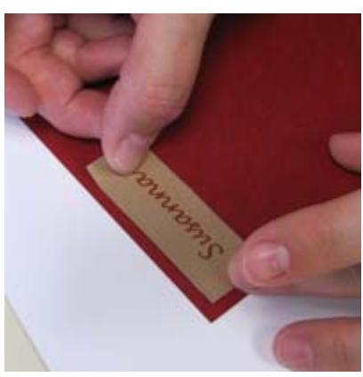
Step 3: Then place them on the bottom page of cardstock so that you have a nice border on all 4 sides.

Example sizes of bottom cardstock: Susanna: 2 ¾" wide x 1 ¼" high Nate: 2 ¼" wide x 1 ¼" high